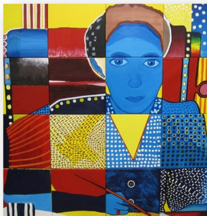
Mount Sinai Panel Artist from left to right

http://www.shopeea.com/2024-mlk-portrait-project