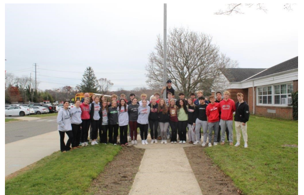
Mount Sinai High School